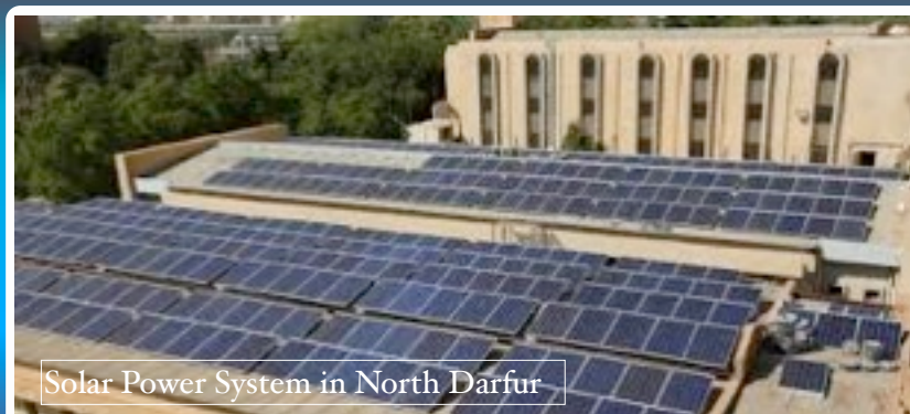
Solar Power System in North Darfur